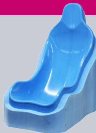
Master model for racing seat tool made of ebabaord EP 138